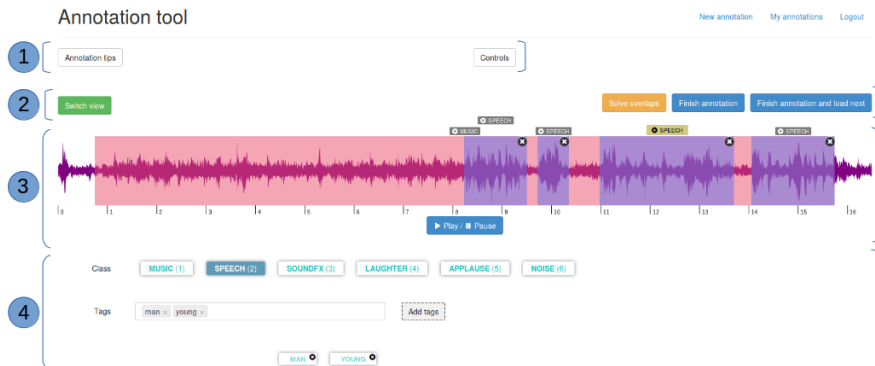
Figure 1: Layout of the annotation tool.

must always receive a salience value of 5. A relative system prevents inconsistencies due to the volume at which the annotator listens to the audio and can be approximated to an absolute annotation using the energy of the audio signal. After having assigned these salience values, the annotation of the current segment is finished and the next one can be loaded. The tool offers the possibility to go back and forth from one phase to the other; however, all salience information is lost when going back to the event identification phase, as events might be modified, and thus, produce different regions in the salience assigning phase.