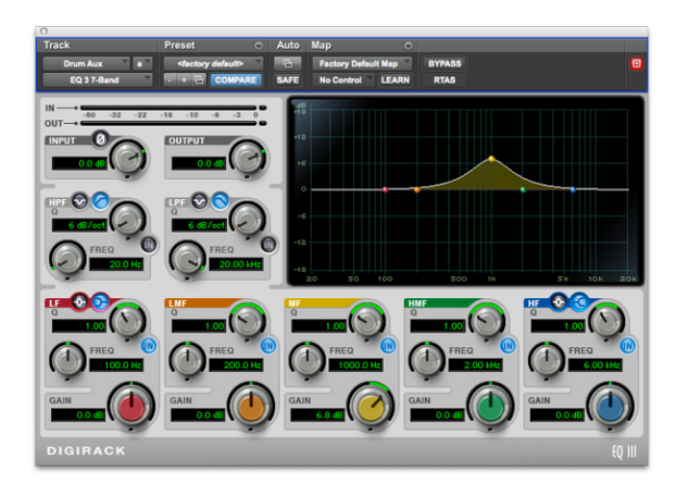
Figure 1: A standard equalizer interface, full of knobs and sliders with labels that do not correlate well to human perception of the resultant effect.

only 6% (for equalization) to 10% (for reverberation) overlap between the vocabulary used to describe presets and the vocabulary used by laypeople to describe audio effects [13]. Given this, naming presets to effectively communicate with end users may be difficult for a tool builder.