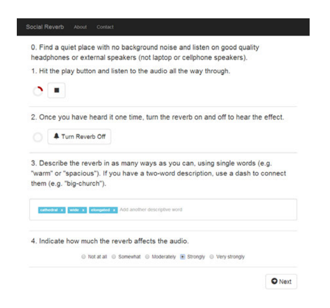
Figure 3: A data collection mechanism for audio effects. Users freely describe the audio effect using their own words.

The settings of each effect are controlled primarily by descriptors, one-word strings that describe the desired sound (e.g "tinny", "underwater"). Each effect is controlled by a separate descriptor, represented as member variables eq_descriptor and reverb_descriptor. When set with a string, our node will search for a matching entry in the SocialFX dataset of 4297 words for the relevant effect and setting. If a match is found, the low-level signal parameters of the effect will be immediately set to the values correspond-